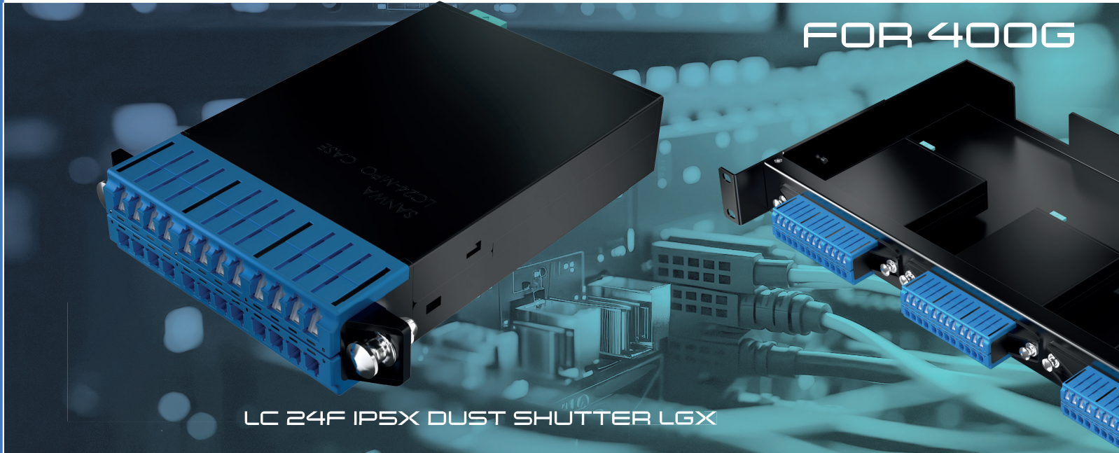
LC 24F IP5X DUST SHUTTER LGX

EFFICIENT CABLE MANAGEMENT | HIGH-DENSITY SOLUTIONS