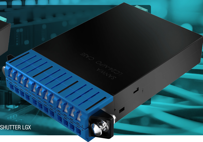
LC 24F IP5X DUST SHUTTER LGX