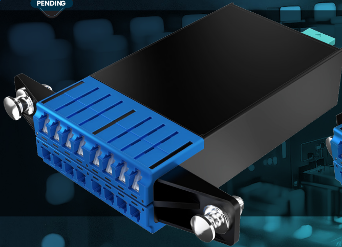
LC 16F IP5X DUST SHUTTER LGX